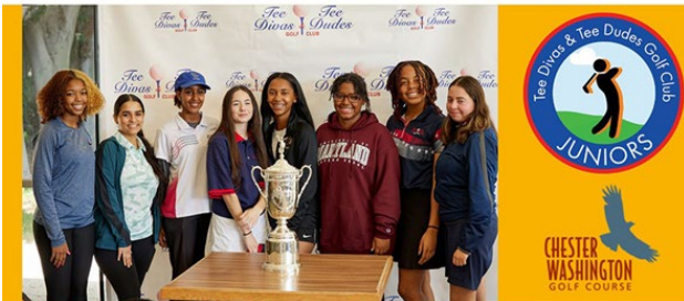
CHESTER WASHINGTON GOLF COURSE 1818 CHARLIE SIFFORD DR, LOS ANGELES, CA 90047

In 1961, Charlie Sifford, famous for his statement " Just Let Me Play, " became the first Black man allowed to join the Professional Golf Association after the "Caucasian Only" clause was removed from their membership By-laws. What was unknown by many in the golf community was that Charlie's battle with the PGA began in California. During the event, our TDTD Juniors will present Charlie Sifford's Significant Moment in Black Golf History.