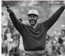
Charles Luther Sifford (June 2, 1922 – Feb 3, 2015) The first African American to play on the PGA Tour.

BLACK GOLF HISTORY BRUNCH & JUNIOR ACHIEVEMENT AWARDS