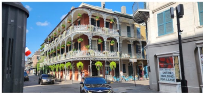
Bourbon Street view

Anchored at the historic world-famous Monteleone Hotel in the heart of Bourbon Street, our travelers experienced the joys of the City. In between, we ate, walked Bourbon Street, ate again, toured the City with a guide to the history and wonders of New Orleans, and ate some more. As they say, “ laissez les bon temps rouler ” (pronounced “Lay-say le bon tom roo-lay”), which is “ Let the good times roll. ” We definitely did that.