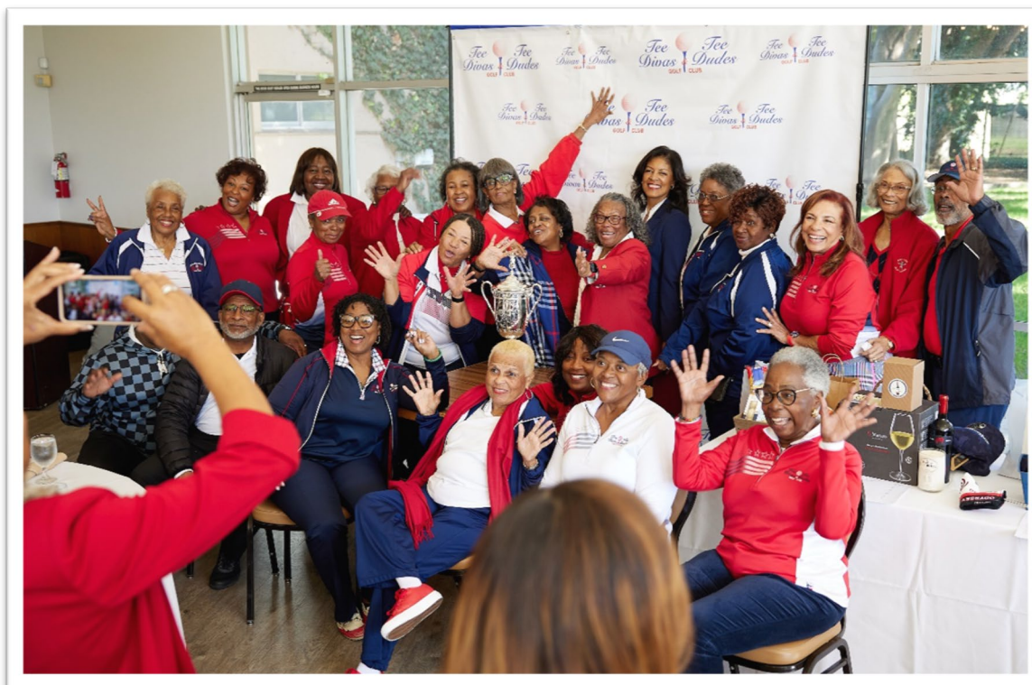
TEE DIVAS & TEE DUDES MEMBERS CELEBRATE

Visit us online at https://teedivas-dudesgolf.com/ ,