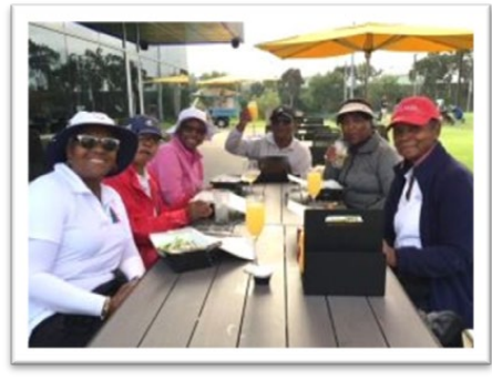
TDTD Off-Season Players at Top Golf's Lakes Golf Course