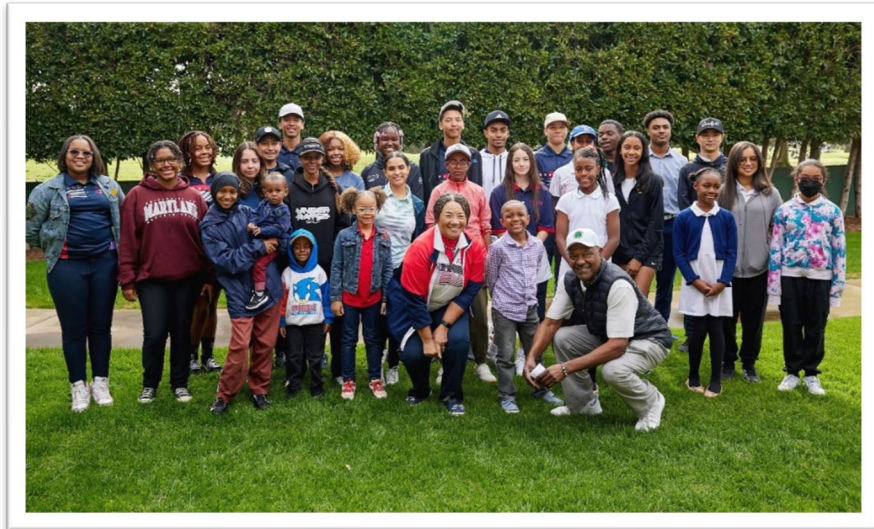
TEE DIVAS & TEE DUDES JUNIORS CHESTER WASHINGTON GOLF COURSE CLUBHOUSE GARDEN